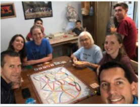
Parents 50th Anniversary