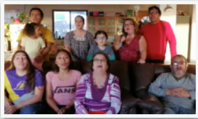
Chilean Church First Choir Special