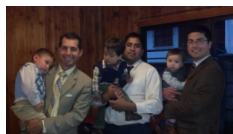
Back in Chile