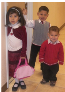
At Gospel Light Baptist Church