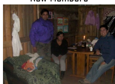
Salvation By Candlelight

The last 2 months have been full of exciting things here in Panguipulli, CHILE. Unfortunately we have gotten in the very bad habit of sending our prayer letters towards the end of the month. So we are sending you a dual update, and attempt to begin sending our updates in the first week of the month as we have done previously.