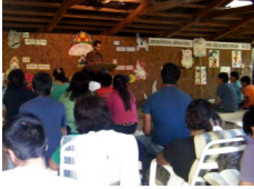
Preaching at Camp