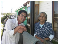
82 yrs Lady Saved